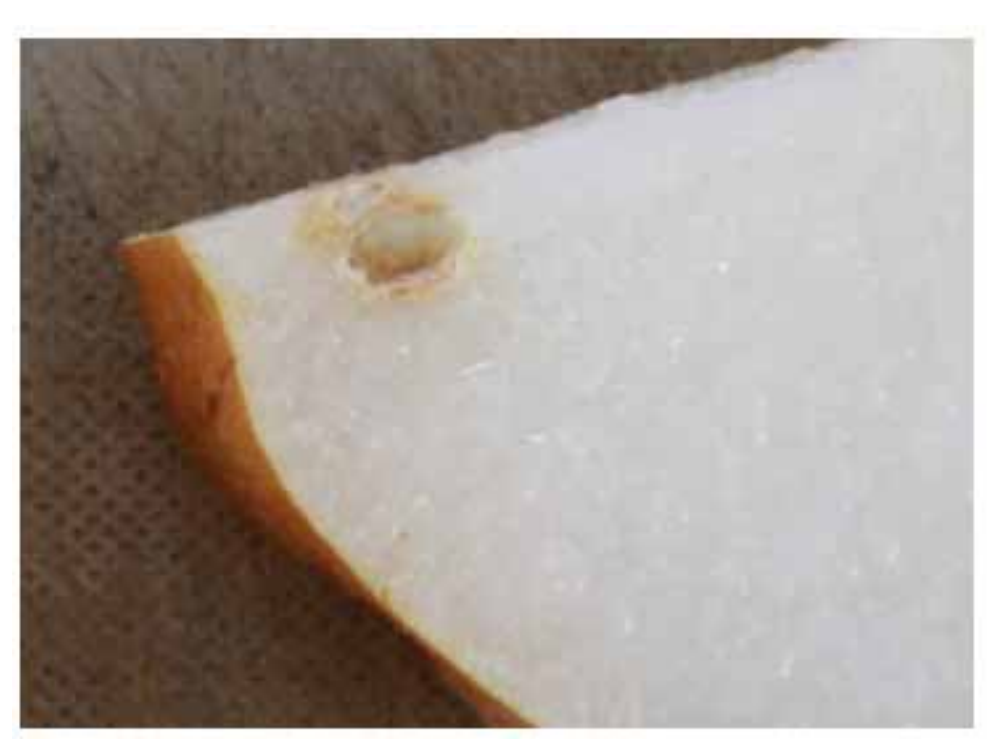
Cork-like flesh disorder