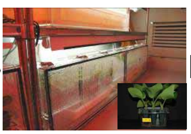
Light, 1,000 ppm carbon dioxide and nutrients are applied in the incubation room