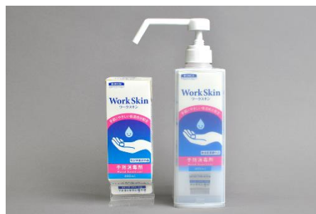
Work Skin (hand sanitizer)