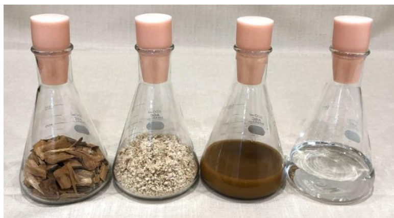
(From left to right) Wood chips, pulp, fermentation culture solution, E2G

In the aviation industry, the societal implementation of SAF is seen as an effective means of achieving decarbonization. There are several types of feedstocks and production methods for SAF, and currently, SAF production using HEFA *3 technology is leading the way globally. However, securing feedstocks is a challenge for the widespread adoption of SAF, and diversifying these feedstocks is also required from the perspective of energy security. ATJ is a technology that can contribute to the stable procurement and diversification of feedstocks by using alcohol produced from various biomass as a raw material for SAF, and Idemitsu Kosan is undertaking a pilot production project to verify its feasibility. If a supply chain for ATJ-SAF using domestically produced E2G derived from non-edible resources represented by woody biomass as a feedstock is established, it will be possible to complete the entire process, from feedstock production to product manufacturing, domestically while avoiding competition with food crops.