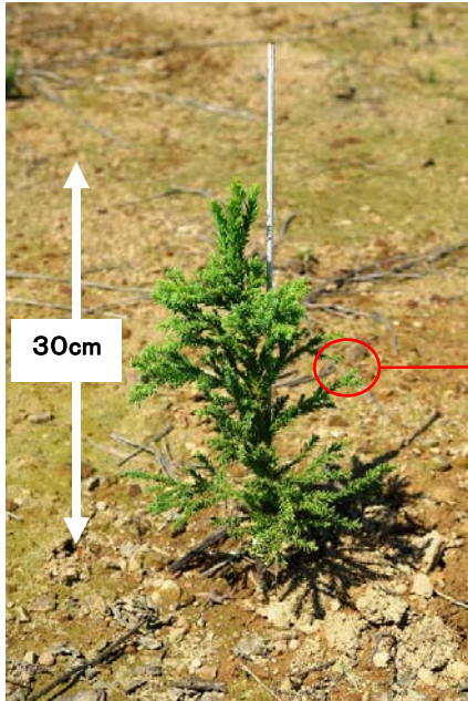
1. Pollen-free cedars parent plant