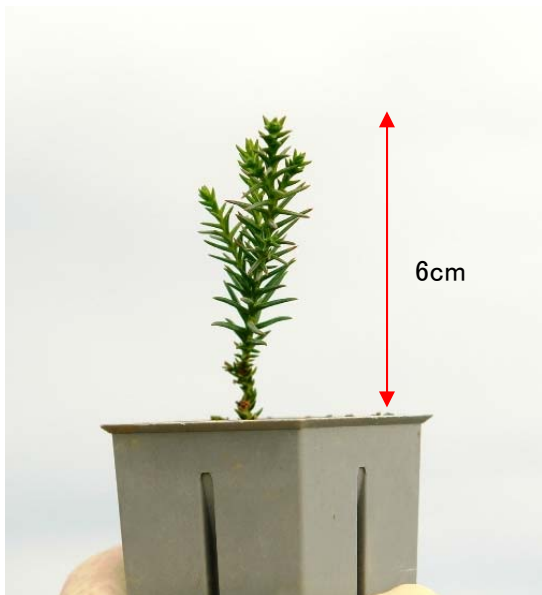
3. Grown plantlet

A cutting about 2cm long was taken from a branch, and photoautotrophic culture technology was applied.