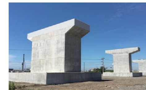
Bridge pier with "CfFA®" (bridge support pillar)

* An admixture for concrete made from combustion ash (fly ash) generated in coal boilers in Ishinomaki plant with less than 1% unburnt carbon (for high quality concrete)