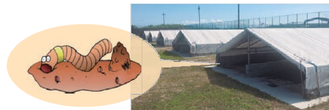
A building that produces soil conditioners by earthworm

In our group, Houtoku (Komatsushima City, Tokushima Prefecture), we produce "Earth earthen soil" where earthworms feed on the waste fungus bed that is generated after the mushroom harvest in the area. Earthworm's soil, as compost, preserves the diversity of soil microbes and contributes to the improvement of soil strength and the healthy growth of crops. In addition, the effective use of waste leads to the circulation of local resources.