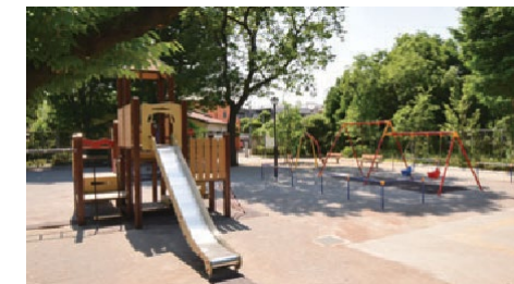
Example of park greening

Nippon Paper General Development is promoting a reforestation project to create a safe and comfortable environment in living spaces such as houses and roads, through park creation, management, and slope greening.