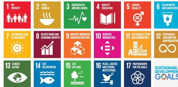
The 17 SDGs

SDGs are the world's common goals from the United Nations!