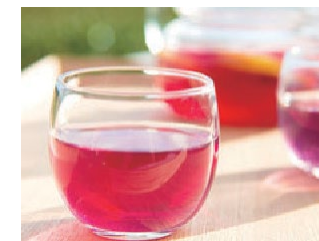
Functional green tea sun rouge

A unique feature of functional green tea, Sun Rouge, is the ability to simultaneously consume anthocyanins and also catechin, (an ingredient of green tea.) Nippon Paper Industries has so far confirmed the effects of suppressing blood sugar rise, etc., and is working to publicize and market Sun Rouge.