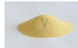
Ingredients for powdered milk.

Nippon Paper Industries' Gotsu plant produces yeast using hemicellulose which comes from wood. Nucleic Acid is obtained in turn from yeast.