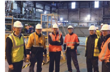
Overseas company dispatch course (Australian Paper)

While social and technological trends are changing dramatically, it is important to educate and re-train people, including skill improvement.