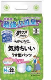
Adult Paper Diaper Hada Care Acty®

As Target 3 targets "all people," elderly people are included. In addition, being able to respond to the challenges of an aging society will be a major issue not only in Japan*1 but also worldwide. The Group manufactures and sells hygiene products that help elderly people live healthier lives.