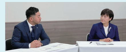
Lecture in session