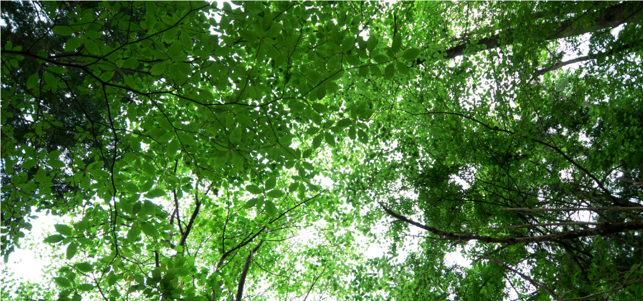
Kitayama company-owned forest (Shizuoka Prefecture)

Disclaimer Statements in this report concerning plans, forecasts, strategies, beliefs, and other forward-looking information related to Nippon Paper Industries Co., Ltd. and companies comprising NIPPON PAPER GROUP, other than those of historical fact, are forecasts of future business performance based on the judgments of management at Nippon Paper Industries Co., Ltd. and NIPPON PAPER GROUP companies in light of currently available information. Accordingly, please refrain from making investment decisions based solely on forecasts of business performance in this integrated report. Actual business performance may differ significantly from these forecasts due to changes in a variety of factors. Reporting Period FY2024/3: April 1, 2023 to March 31, 2024 This report contains some information dated prior to April 1, 2023 and after April 2024. The points in questions have been dated.