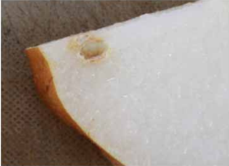
Cork-like flesh disorder